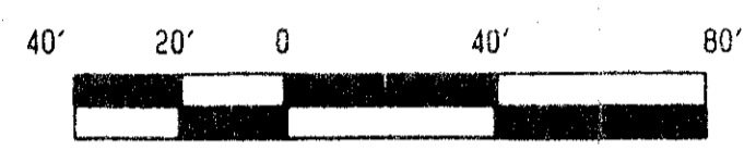
GRAPHIC SCALE IN FEET

BLOCK 9 PALM BEACH FARMS COMPANY PLAT NO. 1 (P.B. 2, PAGE 26)